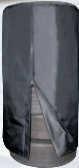
ALL44220 Tire Stack Cover