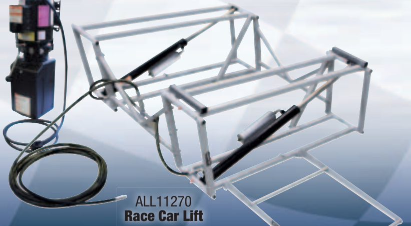
ALL11270 Race Car Lift