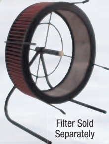
Filter Sold Separately