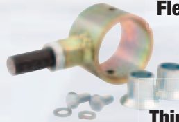
ALL56390 Third Link Assembly