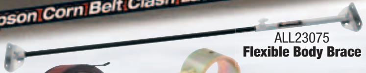
ALL23075 Flexible Body Brace